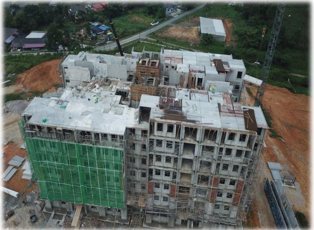
JKM QUARTERS AT TAMPOI, JOHOR