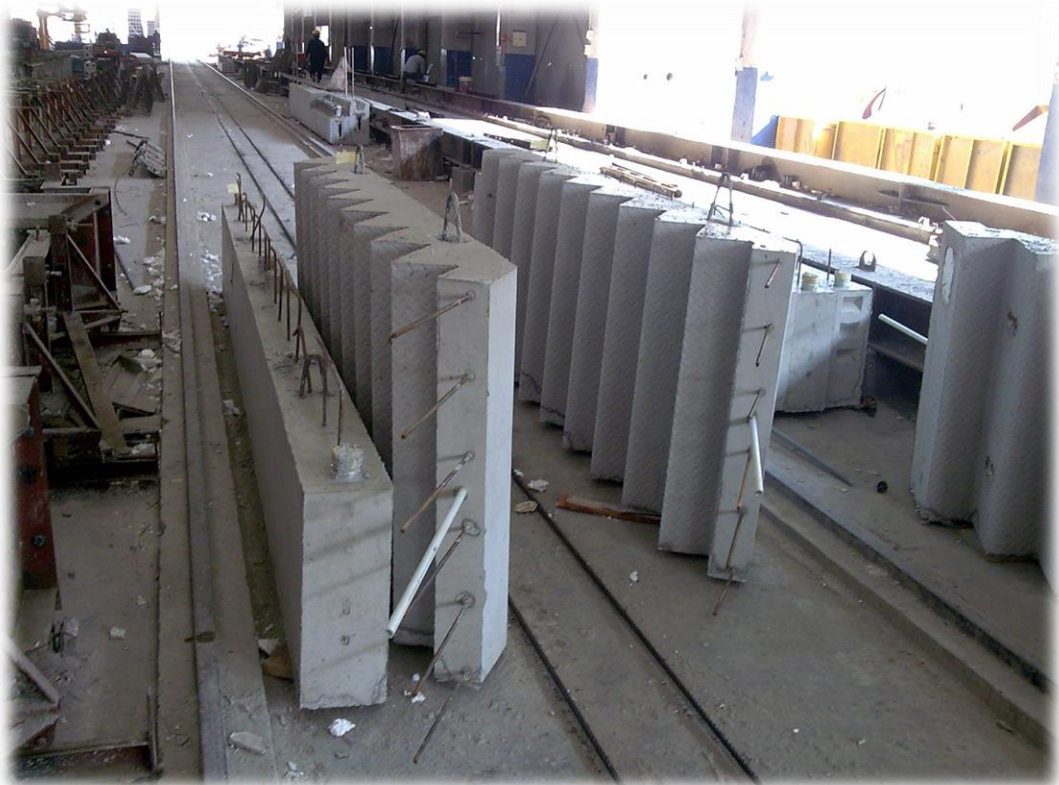
PRECAST STAIRCASE AT EASTERN PRETECH'S FACTORY