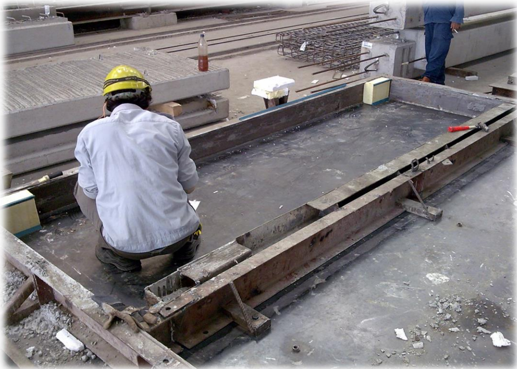
PRECAST TRACK SLAB AT EASTERN PRETECH'S FACTORY