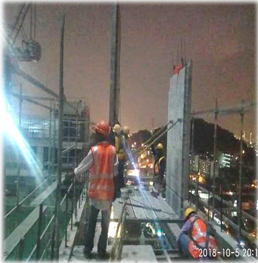
POLICE QUARTERS AT SETIA WANGSA, KUALA LUMPUR