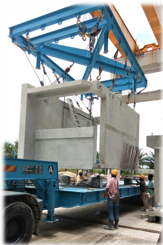
PREFABRICATED PREFINISHED VOLUMETRIC CONSTRUCTION (PPVC) AT VELOBUILD'S FACTORY, AYER HITAM, JOHOR