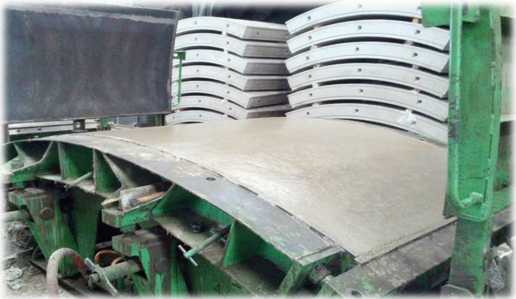
PRECAST TUNNEL SEGMENTS AT EASTERN PRETECH'S FACTORY