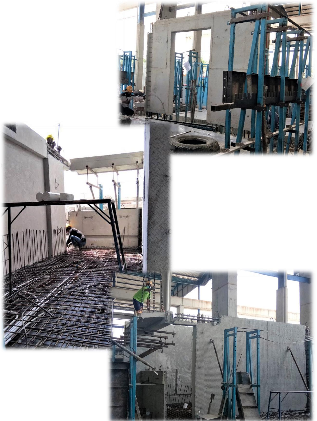
PREFABRICATED PREFINISHED VOLUMETRIC CONSTRUCTION (PPVC) AT VELOBUILD'S FACTORY, AYER HITAM, JOHOR