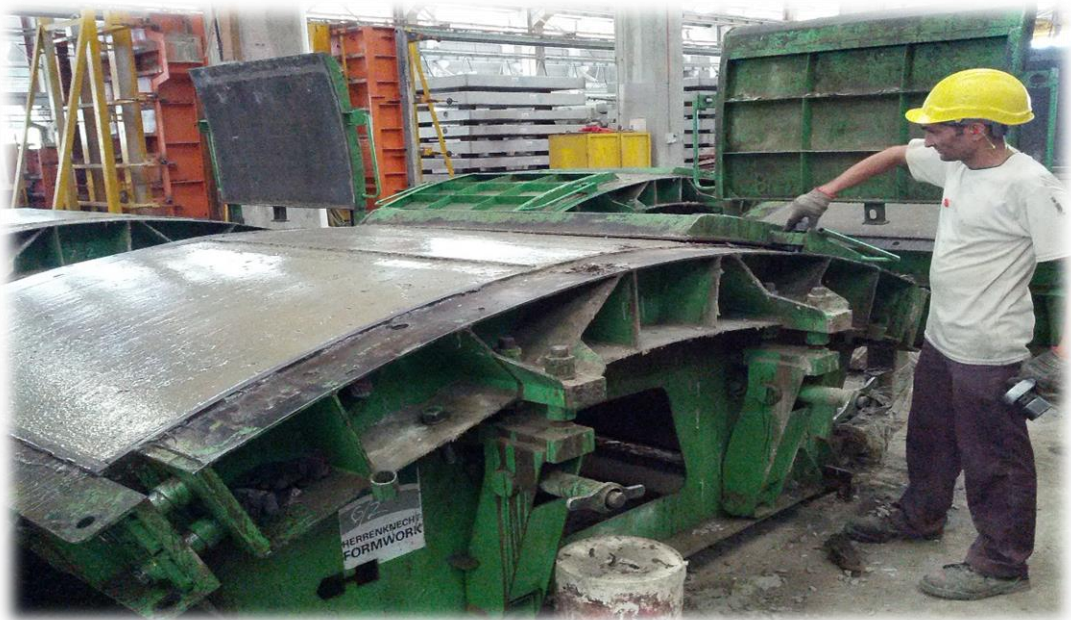
PRECAST TUNNEL SEGMENTS AT EASTERN PRETECH'S FACTORY