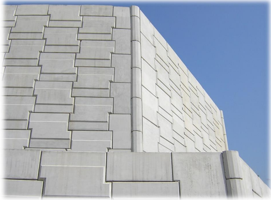
NEW PANTAI EXPRESSWAY - RE WALL AT RTM SLOPE