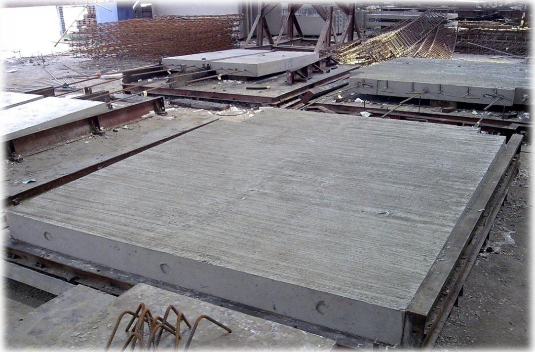
PRECAST TRACK SLAB AT EASTERN PRETECH'S FACTORY