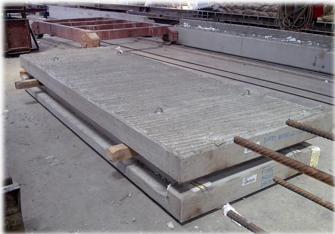
PRECAST COMPONENTS AT EASTERN PRETECH'S FACTORY