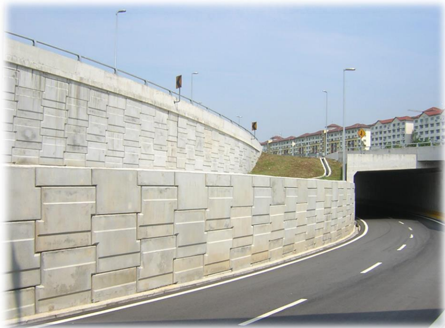
NEW PANTAI EXPRESSWAY - RE WALL AT KUCHAI LAMA JUNCTION